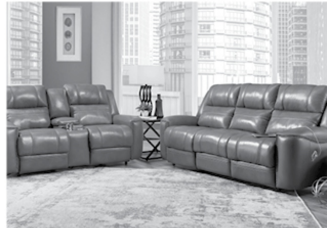
Reclining sets sold at King's Home Furniture in Ackley.

The farm house style is popular right now but the King family keeps an eye on the latest trends through trade magazines and shows in order to stay on top of things.