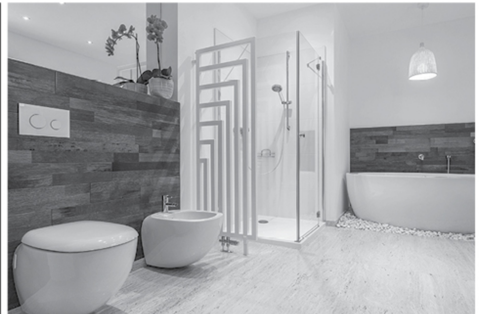
Wood paneling can add a rustic feel to a bathroom.

Before nestling up to a fireplace this winter, homeowners should consider a host of factors and safety measures to ensure their fireplaces are safe and ready for the season ahead.