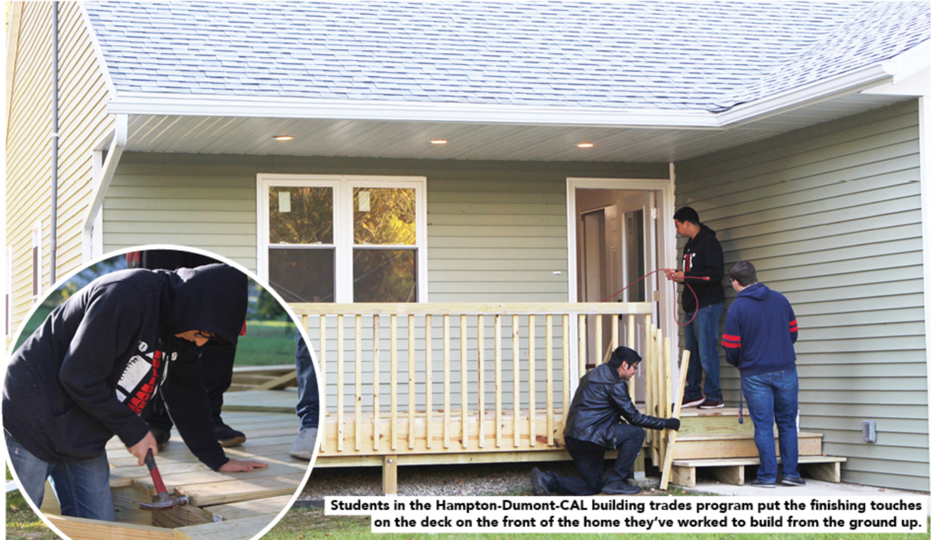
Students in the Hampton-Dumont-CAL building trades program put the finishing touches on the deck on the front of the home they've worked to build from the ground up.